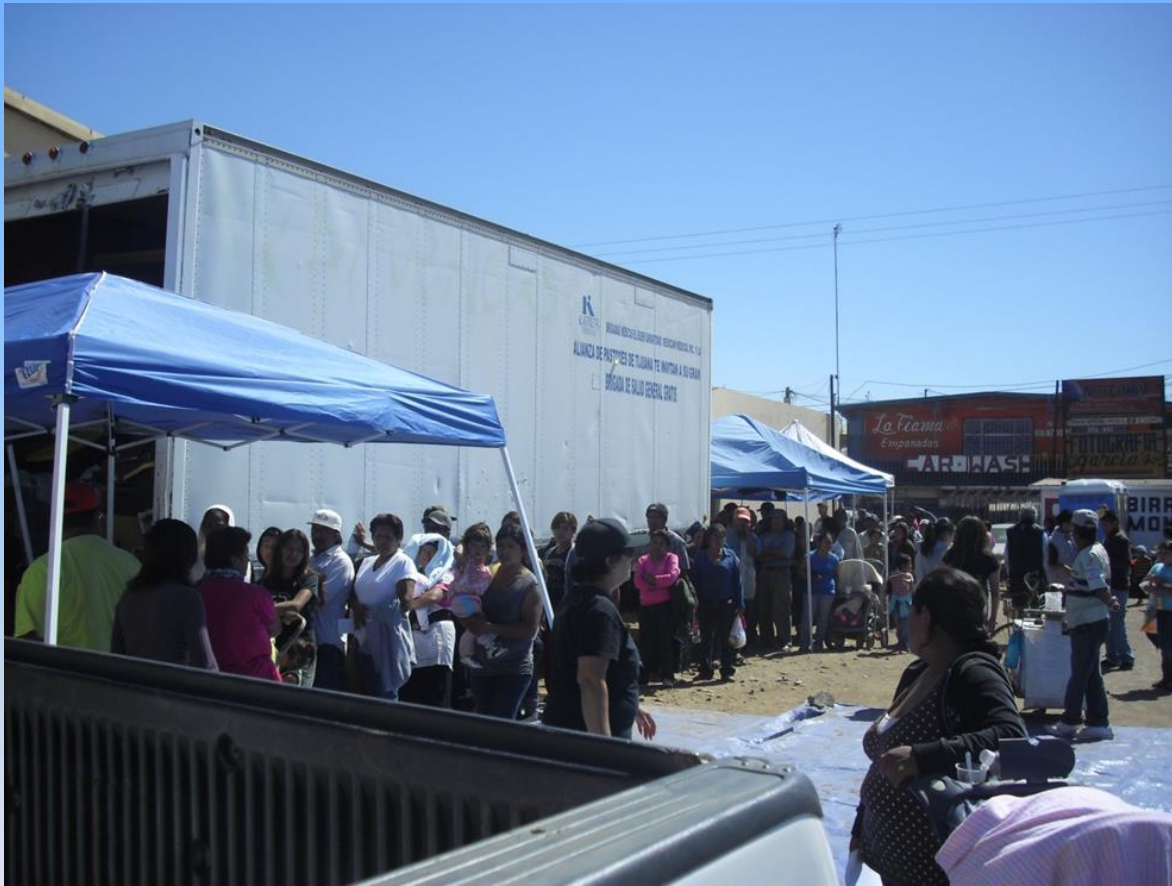
Community Center in the city. Needed Generators and Port a Potties.